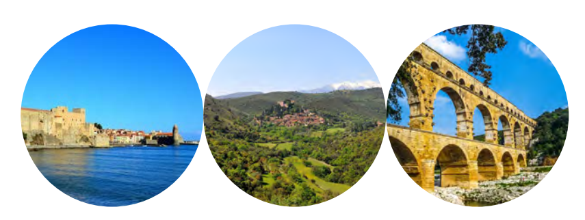
For further information - contact us!

A weekend of adventure and nature in the Cévennes mountains. Truly the Great Outdoors and one of the most unique and well-preserved regions in France, the Cévennes is the perfect destination for a weekend of hiking and cuisine du terroir. Start in Valleraugues, on the Hérault river, then head up to the Mont Aigoual, the tallest peak in the Gard, and then back down to the adorable village of Dourbies. Schist and granite mountains and plateaus will satisfy even the most experienced climber. Local delicacies include chestnut cream, sweet Cévenne onions, pélardon goat cheese, wine, artisanal beer.