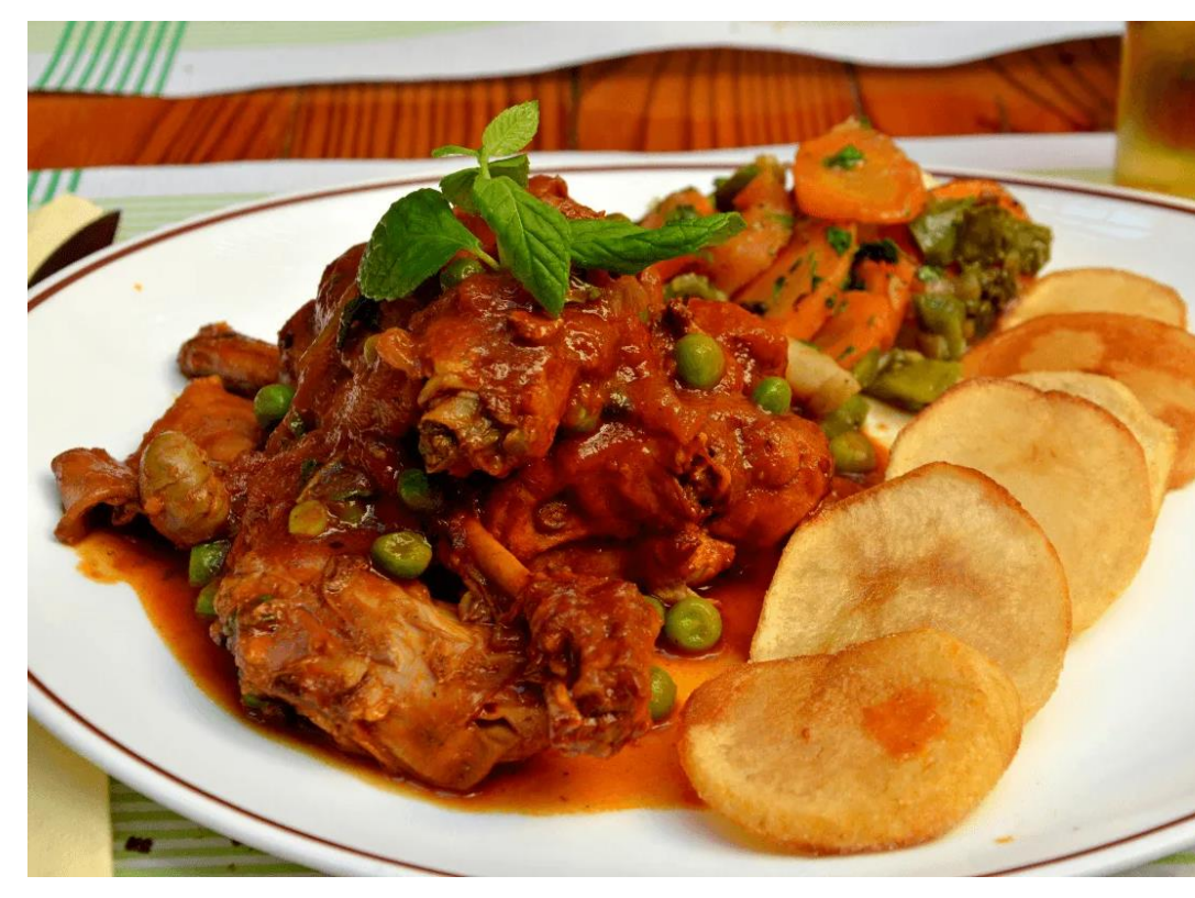
Stuffat tal-Fenek (Rabbit Stew)