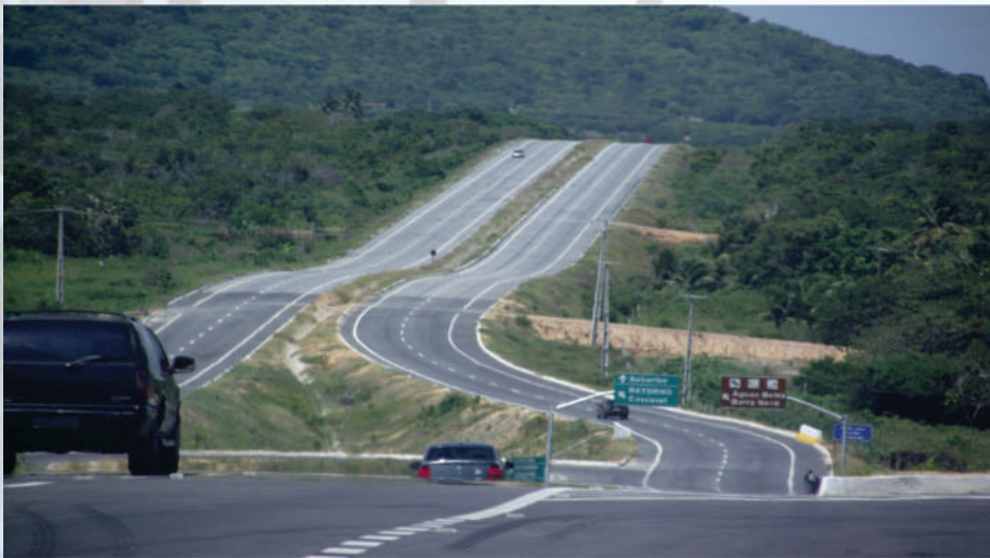
Path of Progress New Double Lane Highway