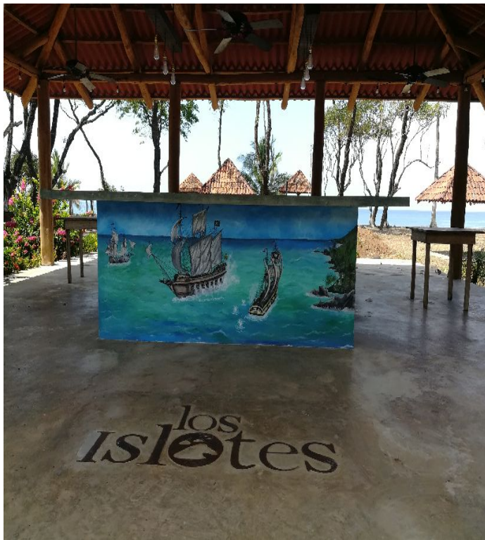
Panama Jack's Beach Bar