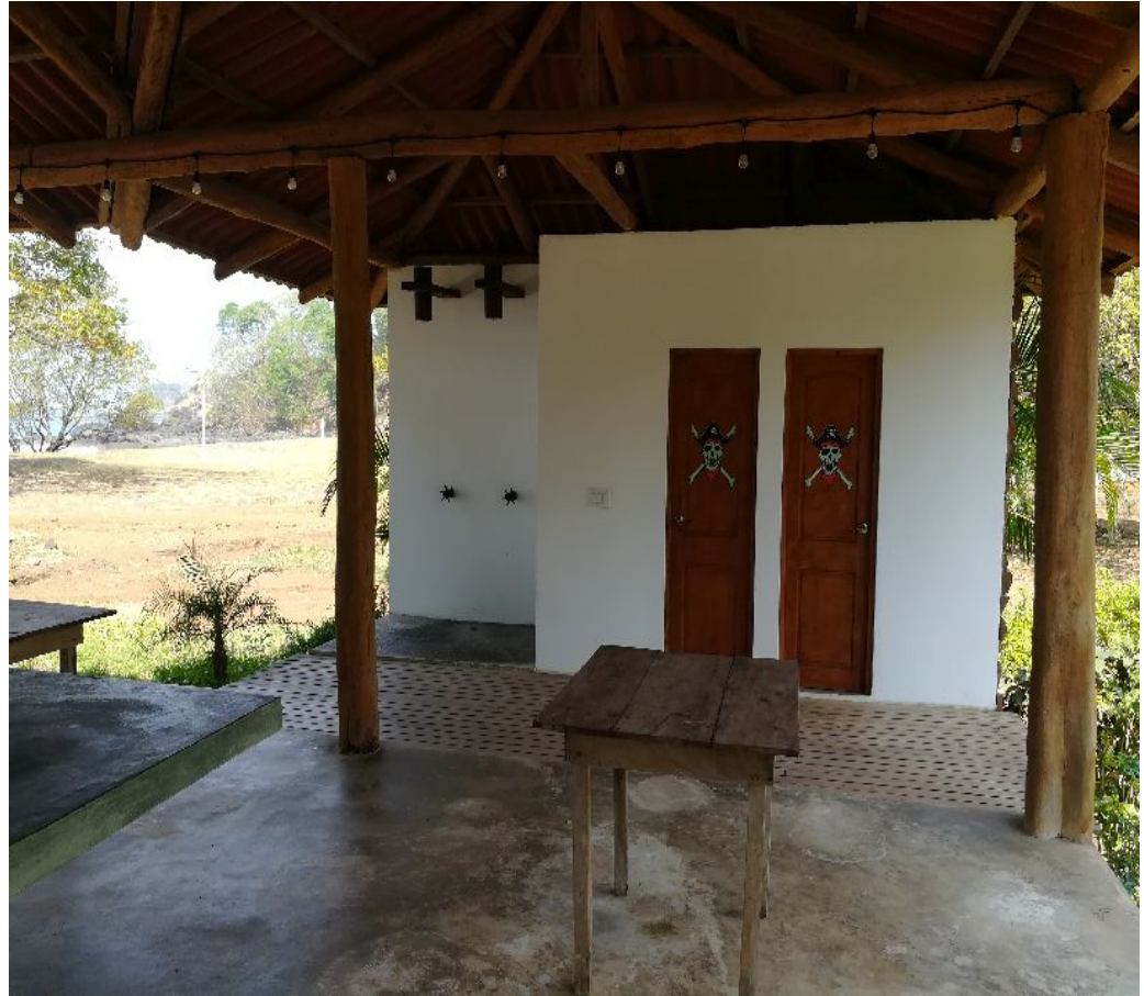
Bathrooms & Showers