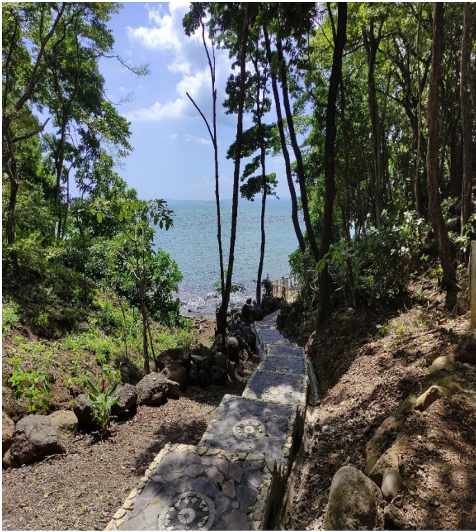
Pathway to Swim Beach