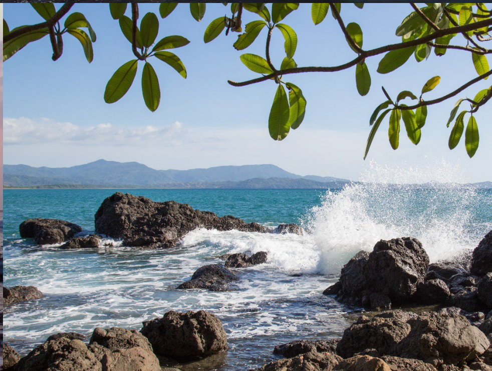
Los Islotes, Azuero Peninsula, Panama