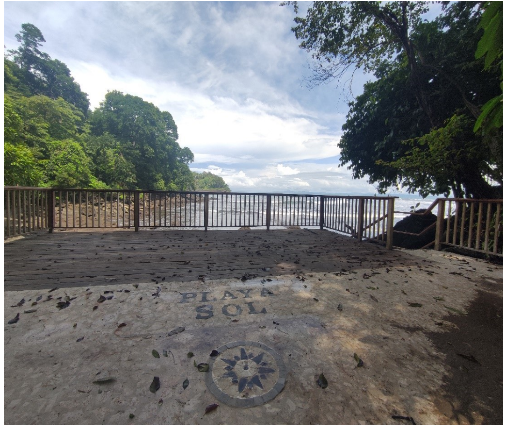
Sunset Deck with Stairs to Beach